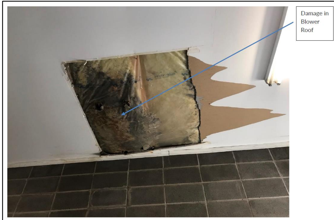
Damages to Blower Building Roof

Anticipated regular work hours will be 8:00 am – 4:30 pm on those days. No service interruptions are anticipated as part of this project although, in case of severe weather, the project may be prolonged.