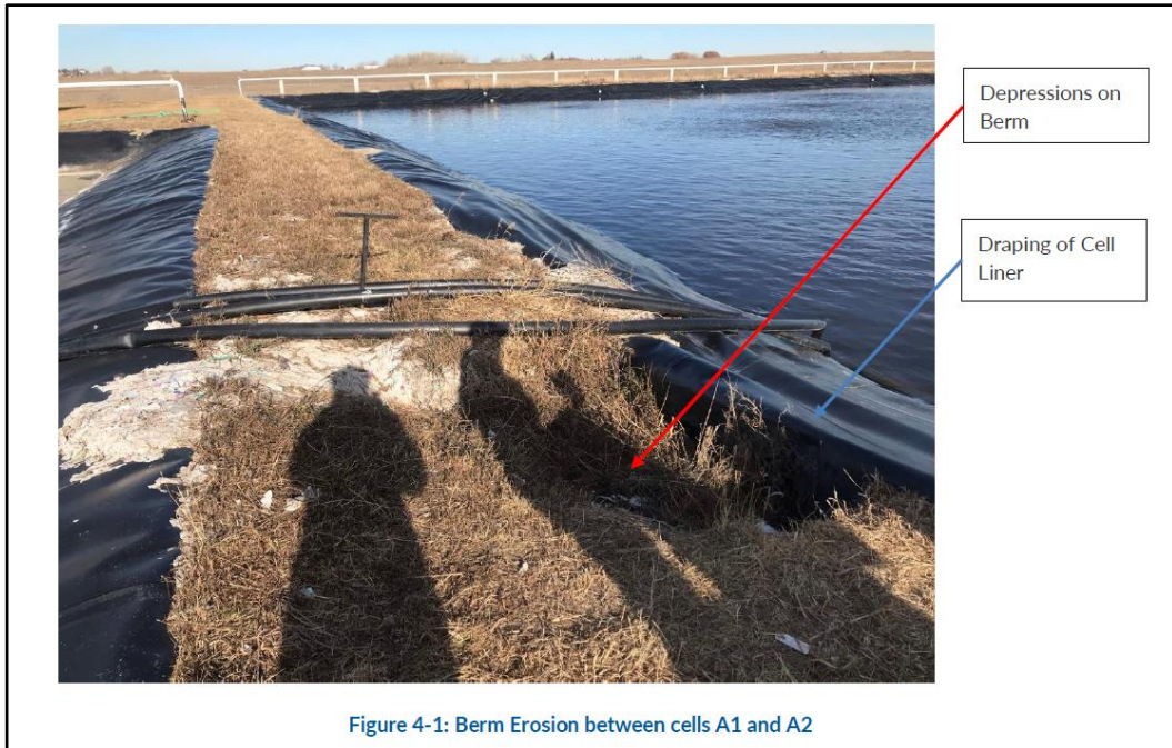
Figure 4-1: Berm Erosion between cells A1 and A2