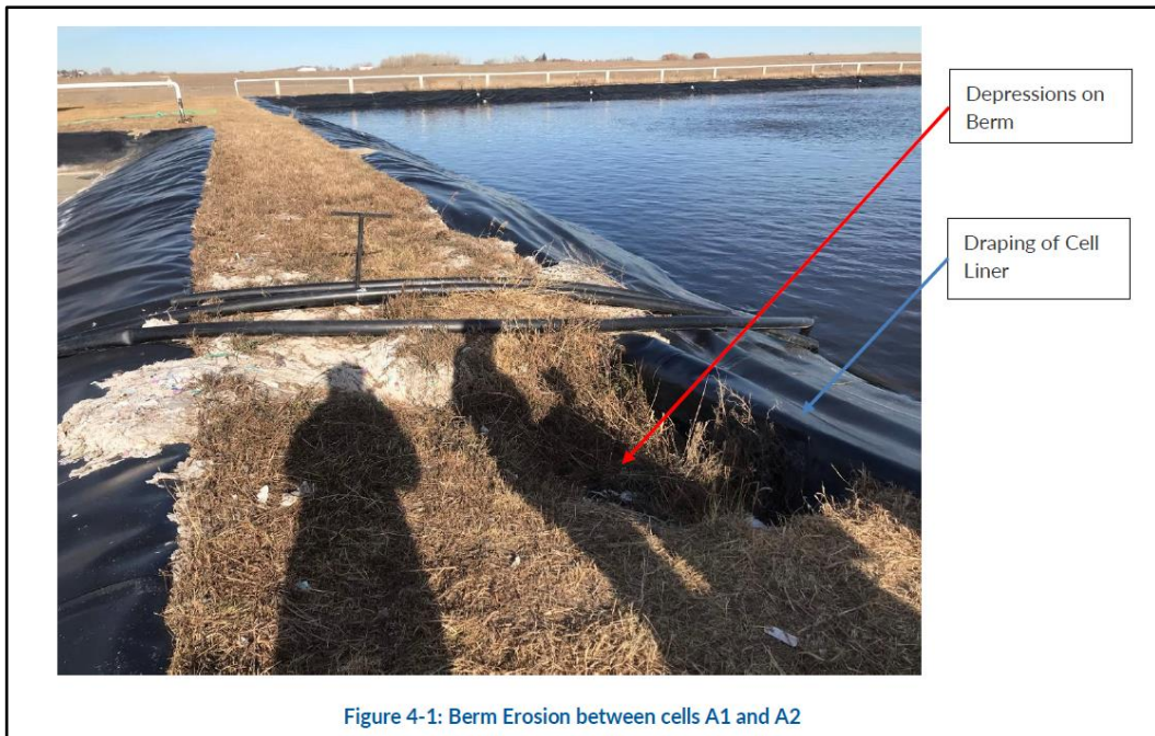
Figure 4-1: Berm Erosion between cells A1 and A2