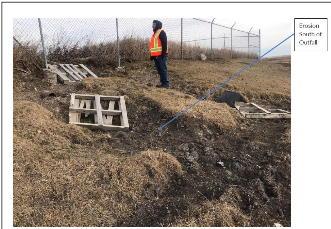
Erosion at outfall of Cell 4